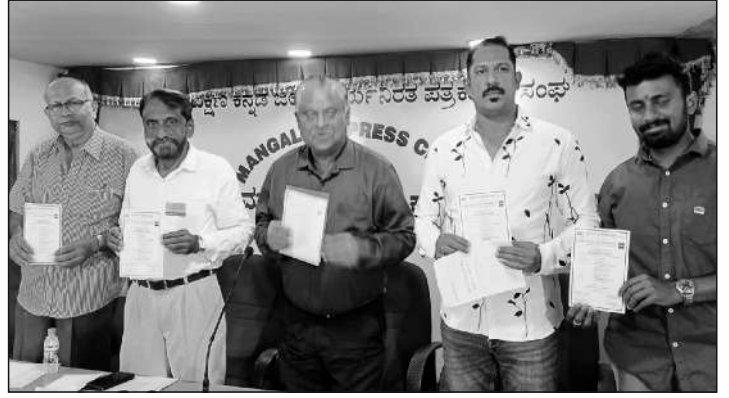
Press conference held at Mangalore Press Club