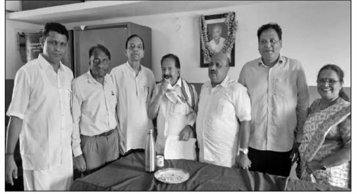
Medical Camp conducted by our Club at Katukukke