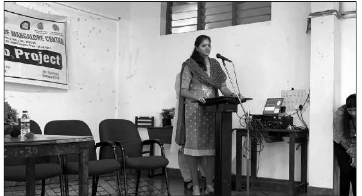
Talk on Sexual Harassment in the work place conducted by our club.