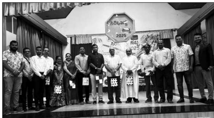
Millet Festival conducted by our Club