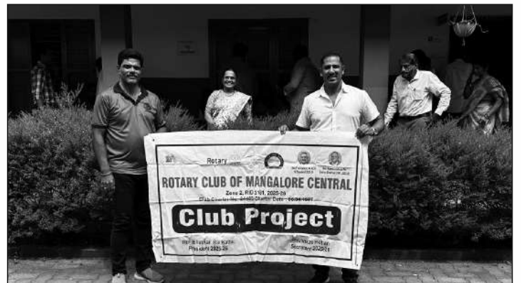
Celebration of Childrens Day by our Club