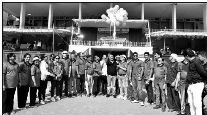
Inauguration of Kreedha Bhandavya 3.0