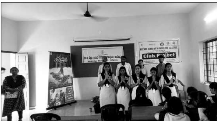
Screening of Hari Dhwarna Kannada Film by our Club at Govt PU College, Hampanakatta