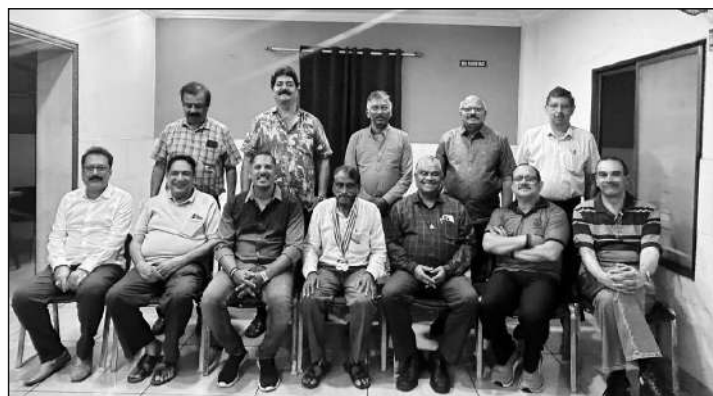
Board Meeting of the Club for November