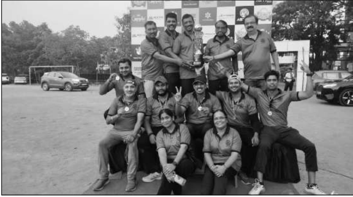
Our Club Cricket Team which won the 2nd prize in RI Dist 3181 Zonal Cricket Tournament of Zone 2