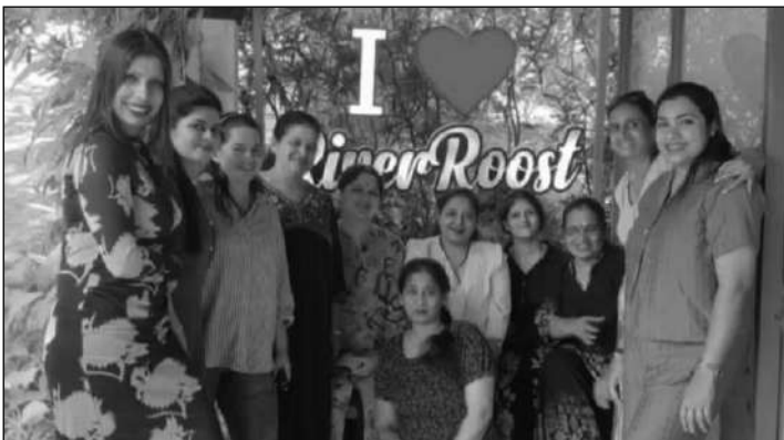
Picnic conducted by our Lady Rtns and Rotary Anns in River Roost Resort Pilikula