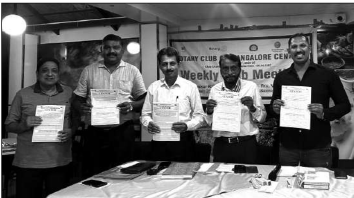
Bulletin Release by Rtn Pushparaj