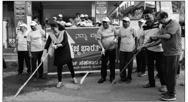
Inauguration of Swacchata Abhiyan by our club in Car Street