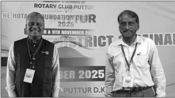
Our Club Delegates seen at Kanike RI Dist 3181 Foundation Seminar at Puttur