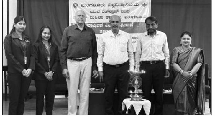
A Special Cam conducted by our Club at National Womens' College, Mangaluru